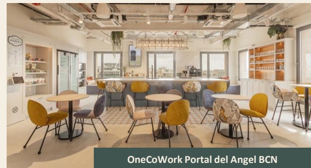
OneCoWork Portal del Angel BCN