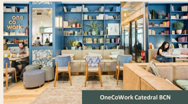
OneCoWork Catedral BCN

Spanning across our different premium locations, we connect and help boost the productivity of more than 1,500 active members .